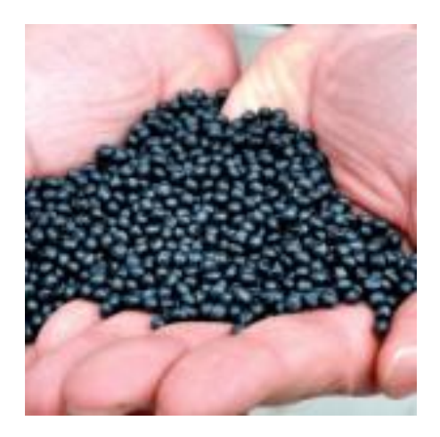
Figure 1: Plastic Output from Ad Rem ASR Sorting Technology<sup>72</sup>

The compounding takes place at one of the five extruders. The final polypropylene compounds can be filled with talcum to allow for higher stiffness or with EPDM to allow for higher shock resistance, or remain unfilled.